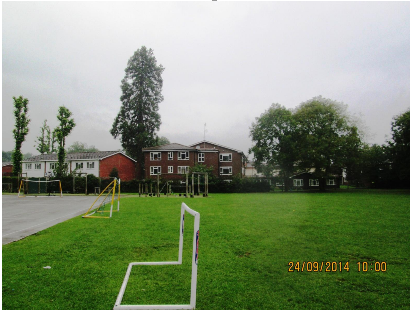
Figure 1 : Looking north from playing fields to location of proposed MUGA and adjoining housing, with The Firs development in the centre